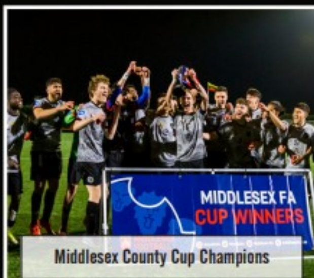
Middlesex County Cup Champions

ProFA FC IS A FA ACCREDITED CLUB UEFA & FA LICENSED COACHES First Aid and Enhanced DBS checks