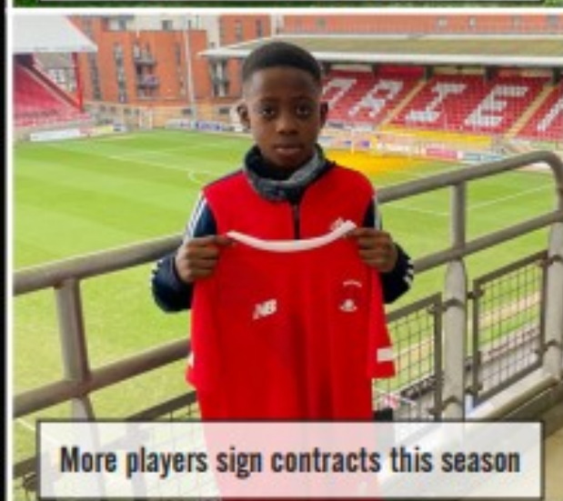
More players sign contracts this season