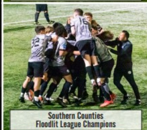
Southern Counties Floodlit League Champions