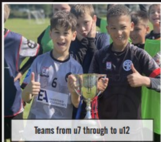
Teams from u7 through to u12

ProFA FC IS A FA ACCREDITED CLUB UEFA & FA LICENSED COACHES First Aid and Enhanced DBS checks