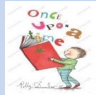
Once Upon a Time...