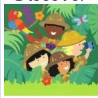
Explore and Discover