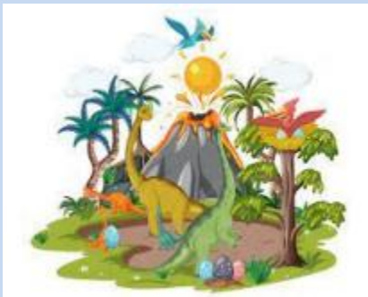
...A Long Time Ago